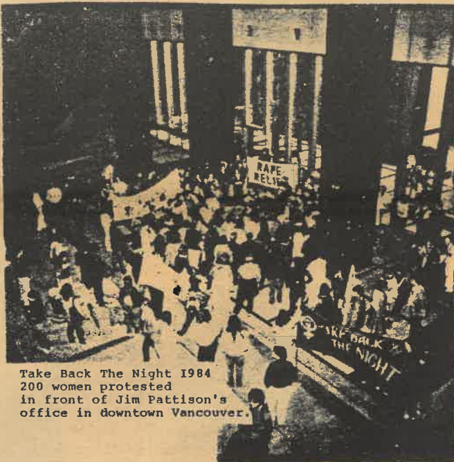
Take Back The Night 1984 200 women protested in front of Jim Pattison's office in downtown Vancouver.

An important point to consider is the amount of ideological control that Pattison's holdings afford him. Pornography is one clear example, but there are others. In June of 1984, Dennis Patterson, the Territorial Minister Responsible for the Status of Women made a presentation before the Fraser Commission in Yellowknife. He said that traditional Inuit culture is being bombarded by the influx of pornography with its racist and sexist messages. Pattison's Provincial News Company controls the magazine distribution in the Northwest Territories.